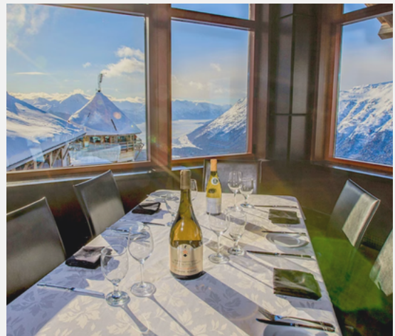
7 Glaciers Restaurant

As the sun sets, our artistic endeavours continue at the Seven Glaciers restaurant on top of the mountain, where we'll savour a decadent dinner.